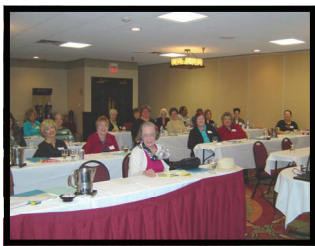
Snapshots from 2009 TIA Meeting in Austin, TX

We plan on having a speaker from the Texas Education Agency to update us on the latest from TEA and on the new buzz word "RTI" of Response Therapy Intervention and how screening for Irlen is a critical piece of this process. Further exploration on the Cross Battery Assessment will be available as well as information on the new Texas licensing law for Licensed Dyslexic Therapists and Licensed Dyslexia practitioners and what this means for you. We are open to adding more topics. Please let us know if you have subjects you'd like covered or speakers you recommend.